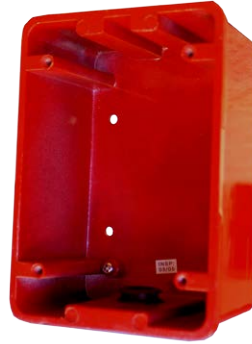
BB-700WP Weatherproof Surface Mount Backbox