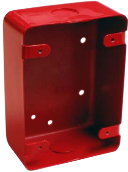
BB-700 Surface Mount Backbox