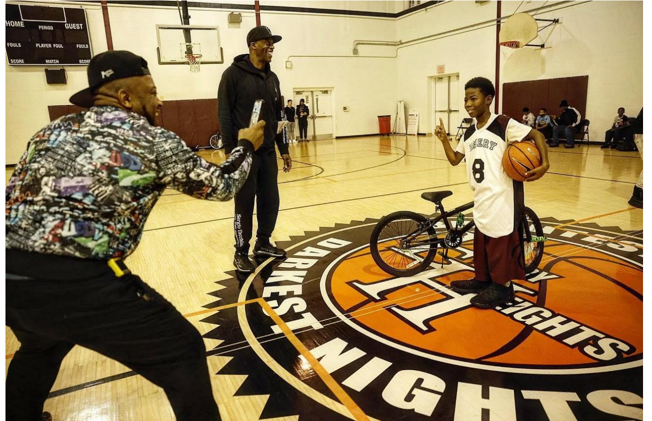
INDOOR BASKETBALL GYM