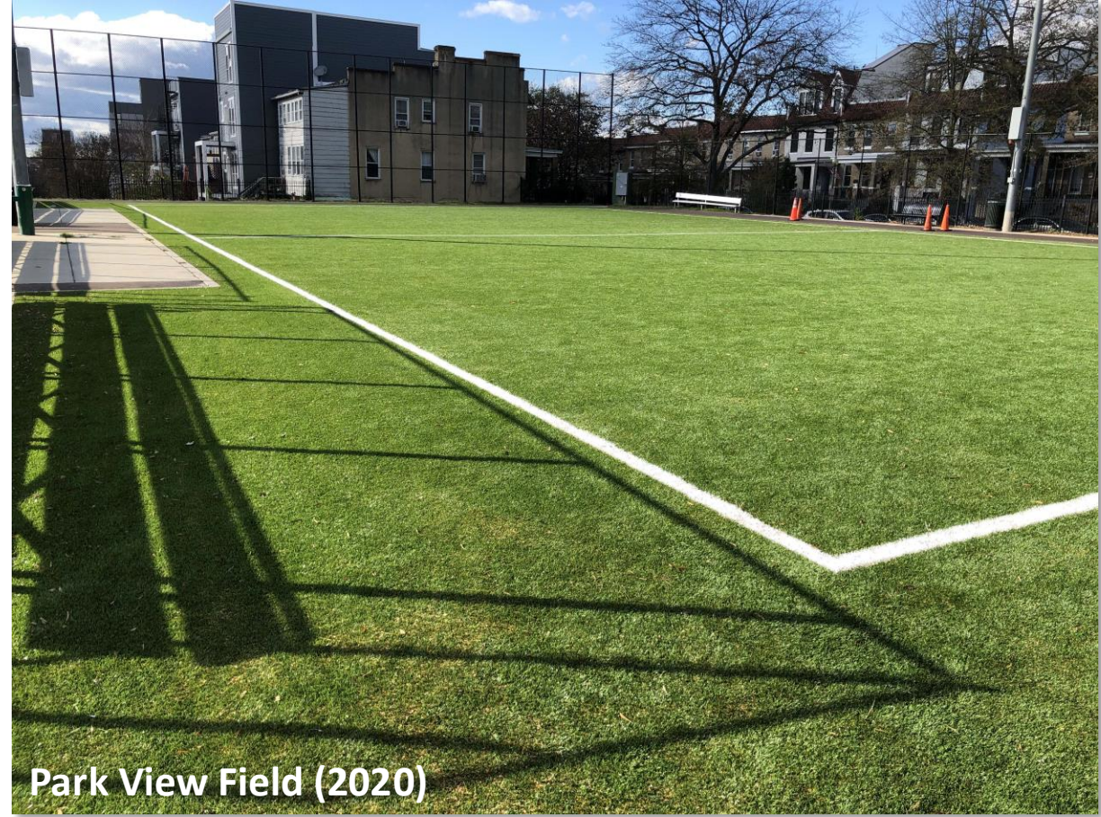
Park View Field (2020)