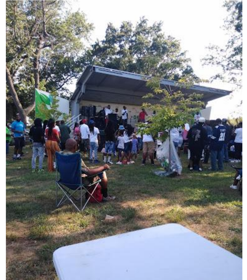
CONCERTS ON THE HILL