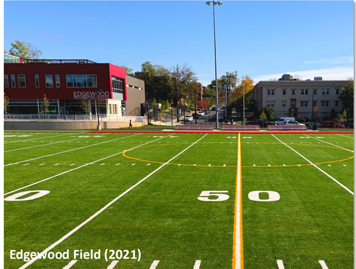
Edgewood Field (2021)