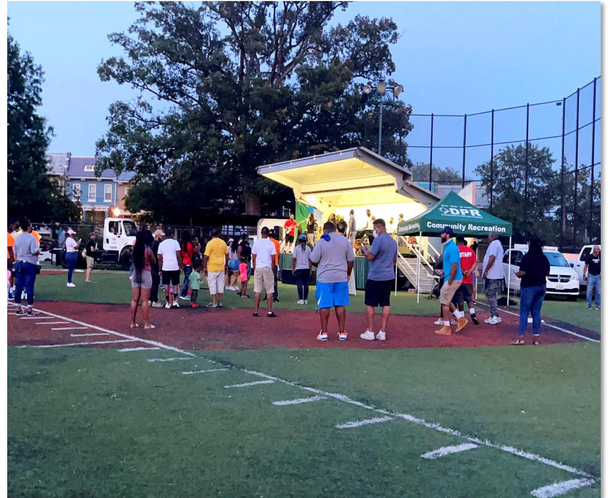
LATE NIGHT HYPE