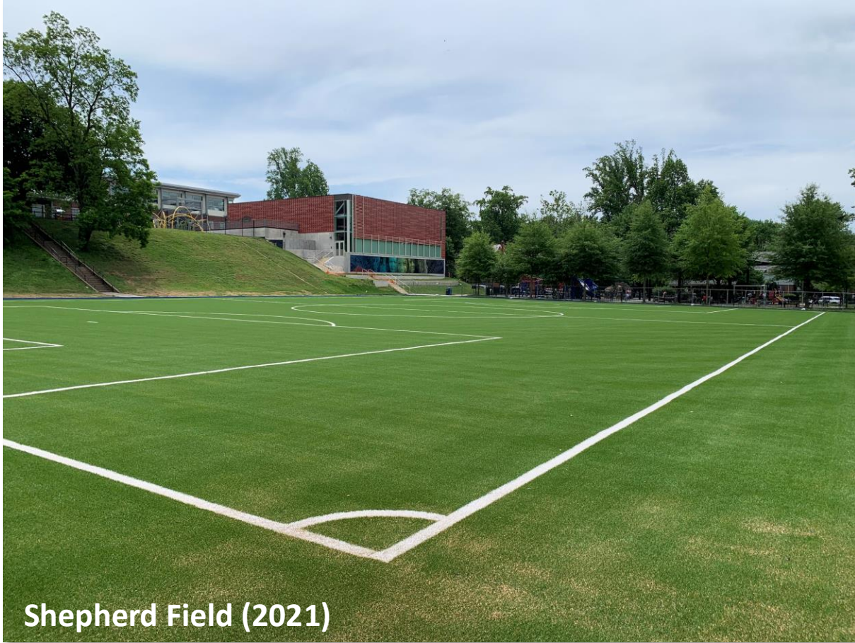
Shepherd Field (2021)