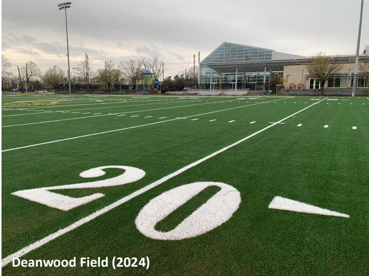
Deanwood Field (2024)