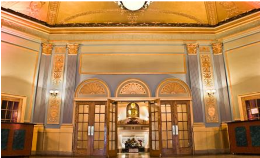
Lincoln Theatre lobby and gathering space.