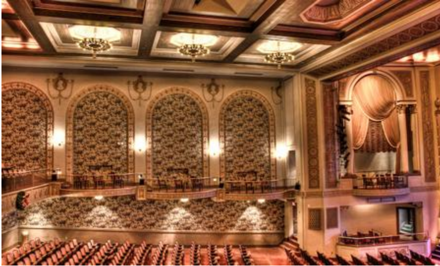
Lincoln Theatre side interior view.