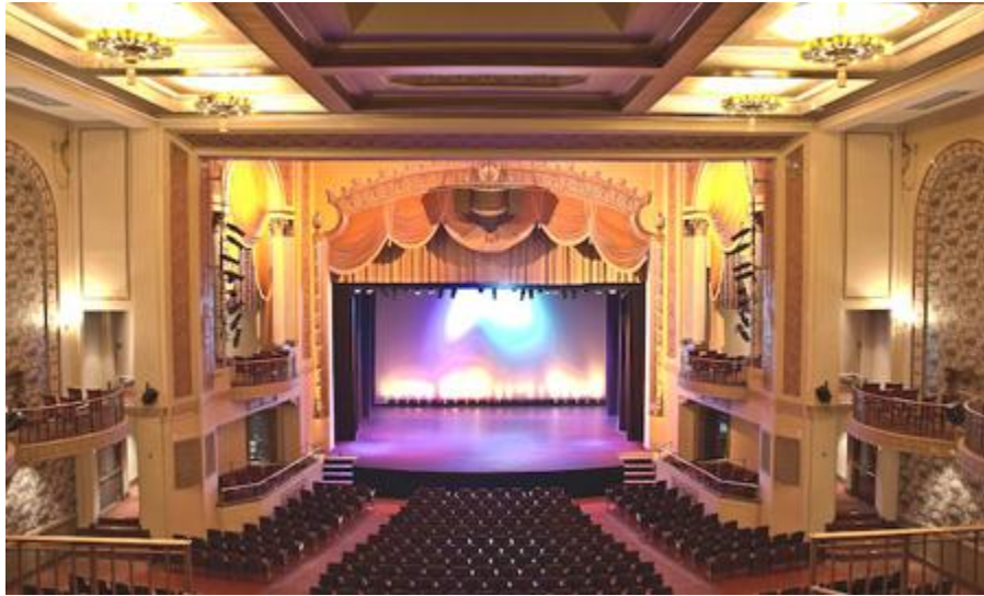
The Lincoln Theatre stage.