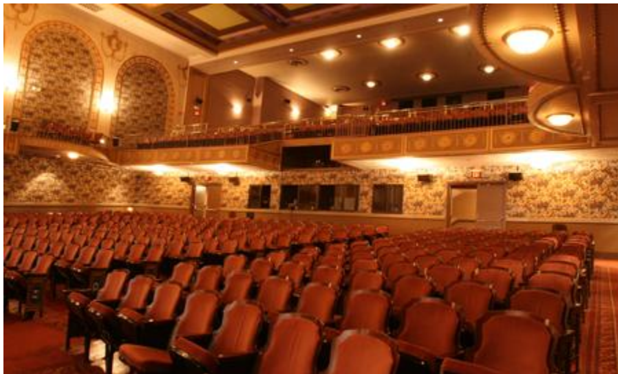
View of theatre seating and balcony space.