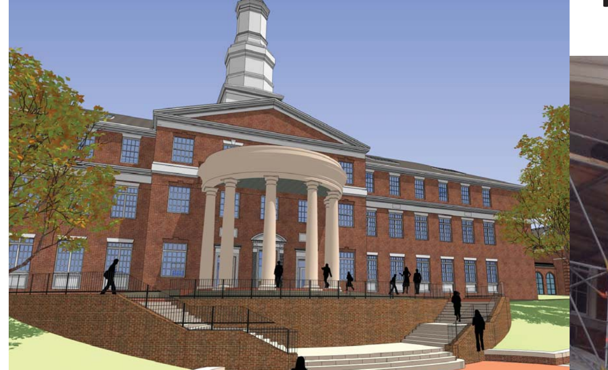
RESTORING CUPOLA TO 1930'S DETAIL