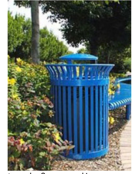
trash & recycling receptacle