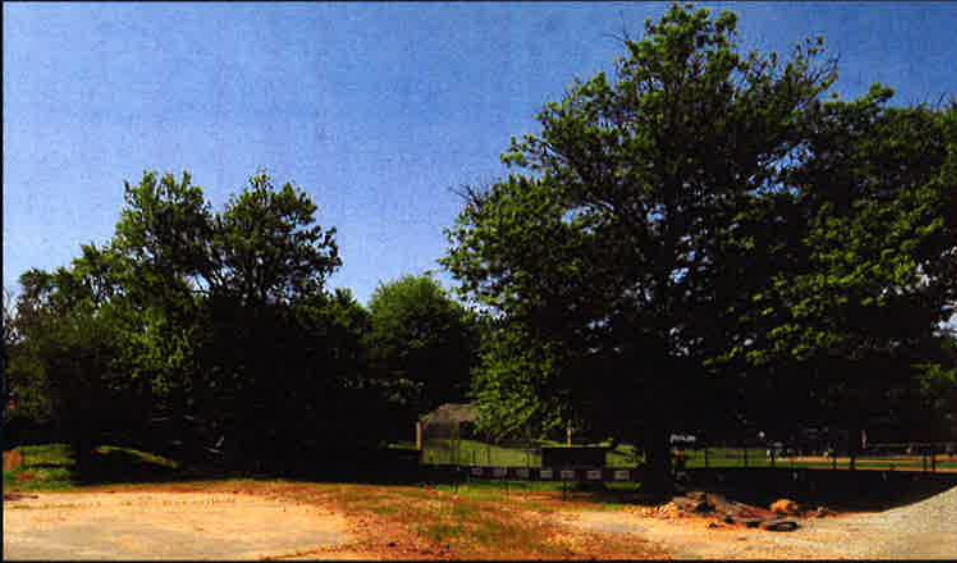
Tree 7 (Left) Tree 6 (Right)