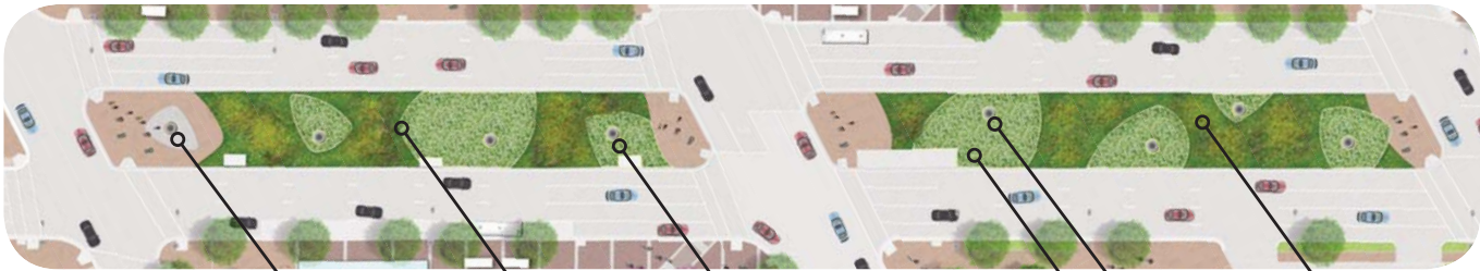
Option B: Art + Light