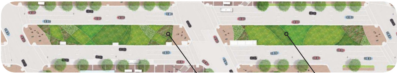
Option A: Landscape