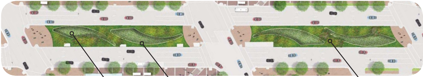
Option C: Light