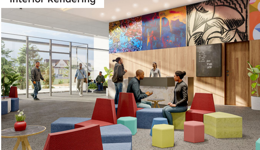
New Addition Lobby