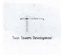
Twin Towers Development