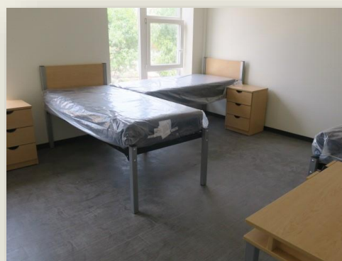
Existing Building Bedroom Furniture

For your safety, only authorized personnel are allowed to access the construction sites.