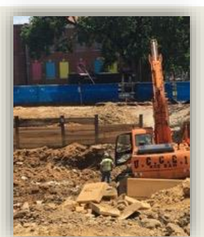
Sheathing and Shoring

For monthly construction updates, please visit DGS Short-Term Family Housing portal at <a href="https://dgs.dc.gov/page/short-term-family-housing-construction-projects1-0">https://dgs.dc.gov/page/short-term-family-housing-construction-projects1-0</a> Questions? Please direct all inquiries to <a href="https://gradiana.pdf">STFHprojects.dgs@dc.gov</a>