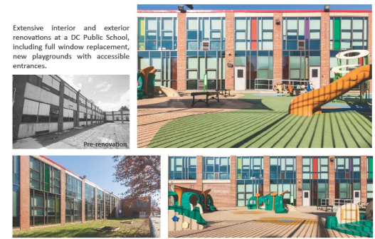
Extensive interior and exterior renovations at a DC Public School, including full window replacement, new playgrounds with accessible entrances.

Eleanor Holmes Norton Park | Southwest Waterfront