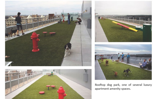
Rooftop dog park, one of several luxury apartment amenity spaces.

C.W. Harris Elementary | Marshall Heights