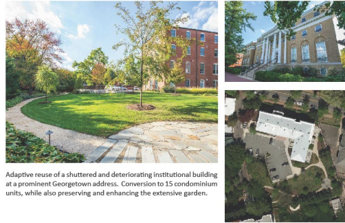
Adaptive reuse of a shuttered and deteriorating institutional building at a prominent Georgetown address. Conversion to 15 condominium units, while also preserving and enhancing the extensive garden.