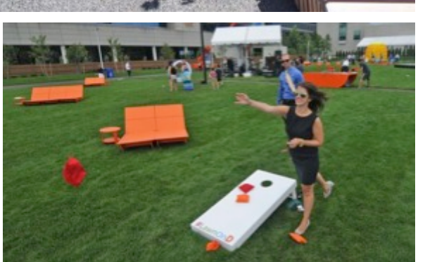
Social + Play