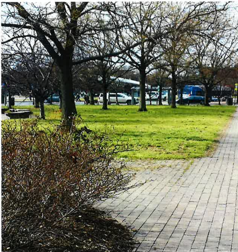
Photo 5a – North Plaza looking southwest with the Metro entrance in the background. Note: the playground shown in Photo 5b is to the left.