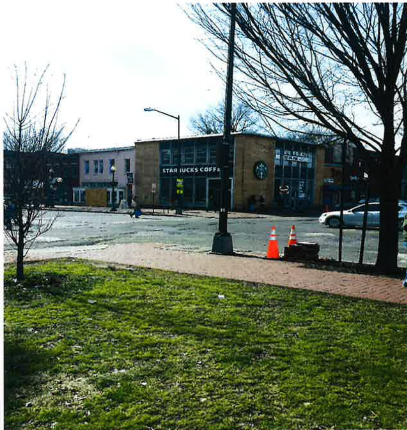
Photo 14b – looking southwest from the extreme eastern portion of the South Plaza at the 8th St. (left) /