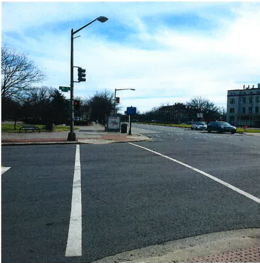
Photo 8a – looking east across 8th St. / Pennsylvania Ave. intersection. Note: North Plaza is to the left and the white building in the background is the old Haines Store.