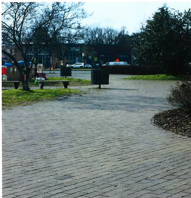
Photo 5b – North Plaza looking south at the playground. Note: Starbucks and Long&Foster Realtors are in the background.