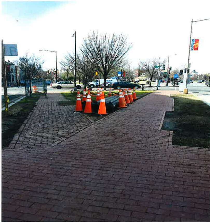
Photo 14a – looking west at the 8th St. / 'D' St. (left) and 9th St. / Pennsylvania Ave. (right) intersections. Note: the white building at 901 Penn. Av. shown in Photos 8b & 9b is out of view to the left.