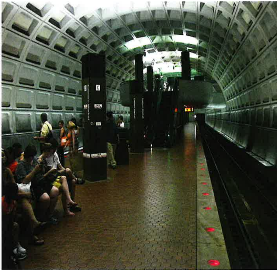
Photo 3a – photo of the island platform on the lower-level with benches and a crossover platform.