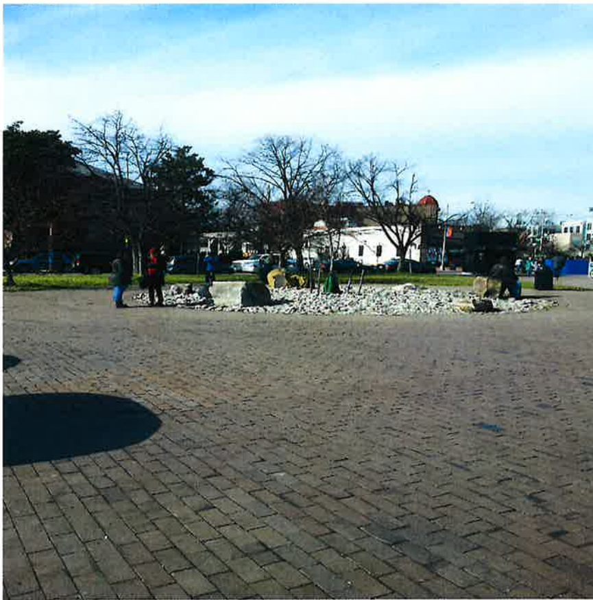
Photo 4a – South Plaza looking west. Note: the library is to the left and the Metro entrance is to the right.