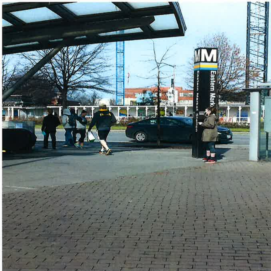
Photo 1b – looking north at the Metro entrance with escalators to the left. Note: construction crane in background as seen in Photo 4a.