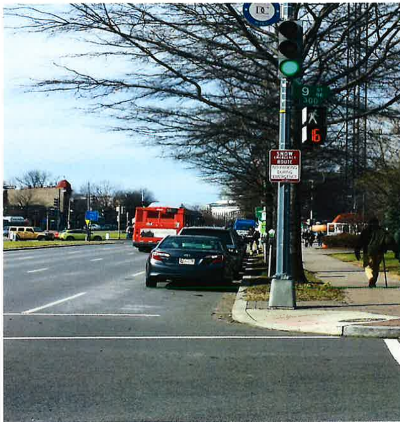
Photo 13b – looking west along westbound lane of Pennsylvania Ave. Note: the south end of the North Plaza is on the right.