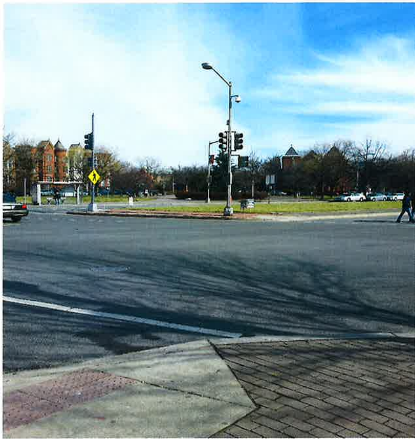
Photo 13a – looking northeast across both lanes of Pennsylvania Ave. from in front of CVS Pharmacy at the southwest corner of the 7th St. / Penn Ave. intersection. Note: the Metro entrance is to the right.