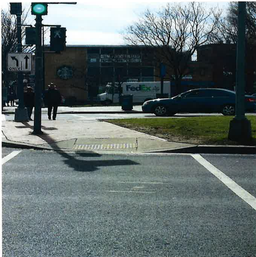
Photo 7b – looking south along 9th St. across the Pennsylvania Ave. median at Starbucks.