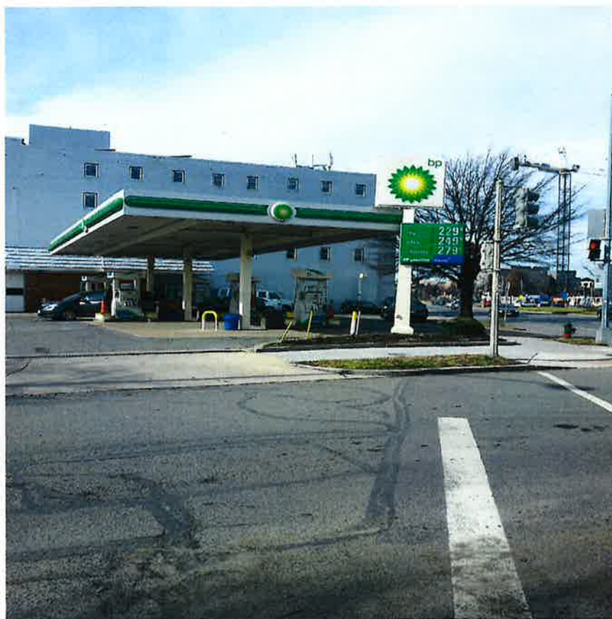
Photo 8b – looking west across 10th St. at the BP filling station. Note: the white building in the background is the old Haines Store at 901 Pennsylvania Ave.