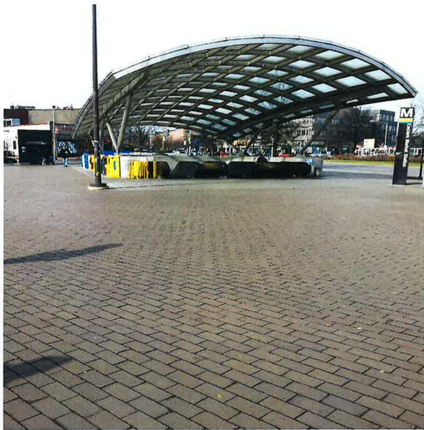
Photo 1a – looking northwest at the Metro entrance. Note: the escalators in the foreground and the elevator to the left.