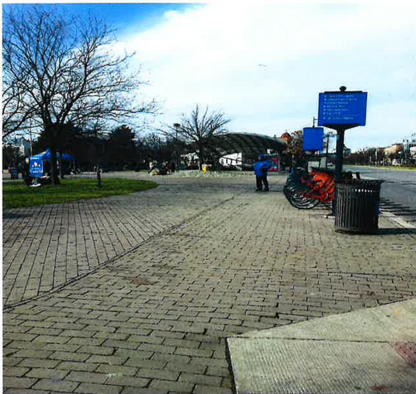
Photo 4b – South Plaza looking west along eastbound lane of Pennsylvania Ave. Note: Metro entrance is in the background.