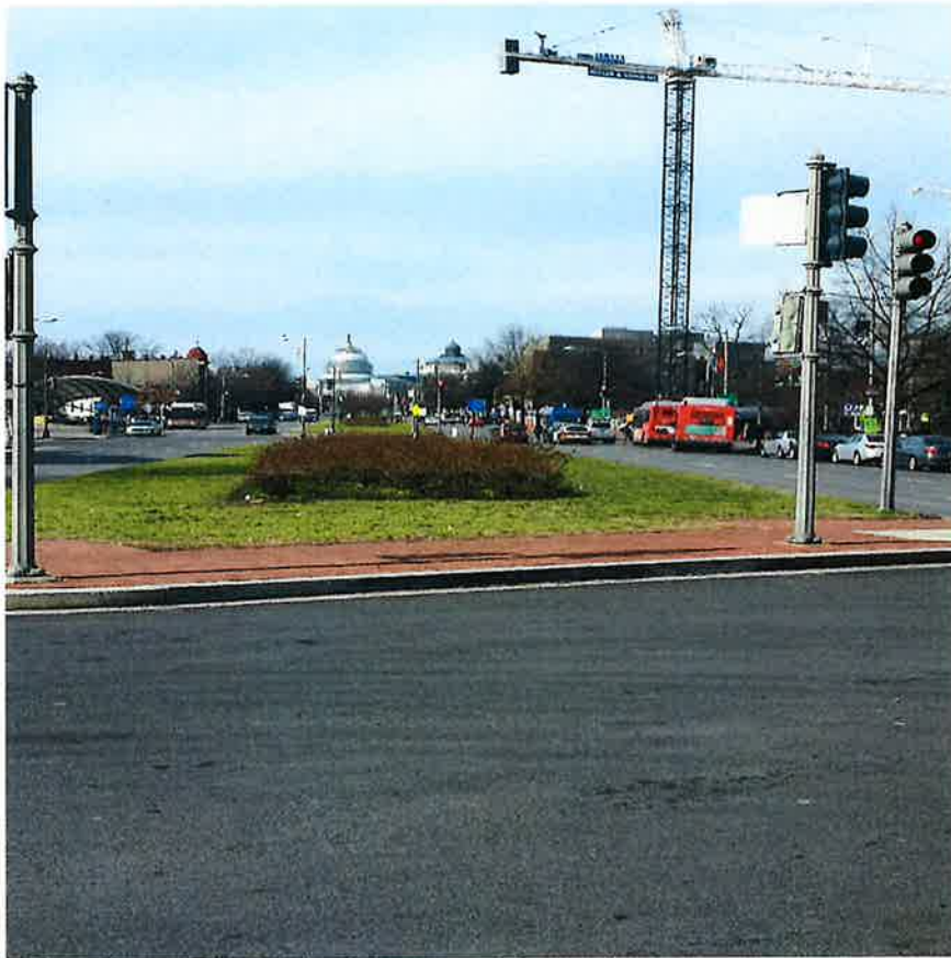
Photo 7a – looking west at the Pennsylvania Ave. median between eastbound (left) and westbound (right) lanes at the 9th St. traffic light. Note: the Metro entrance in the left background.