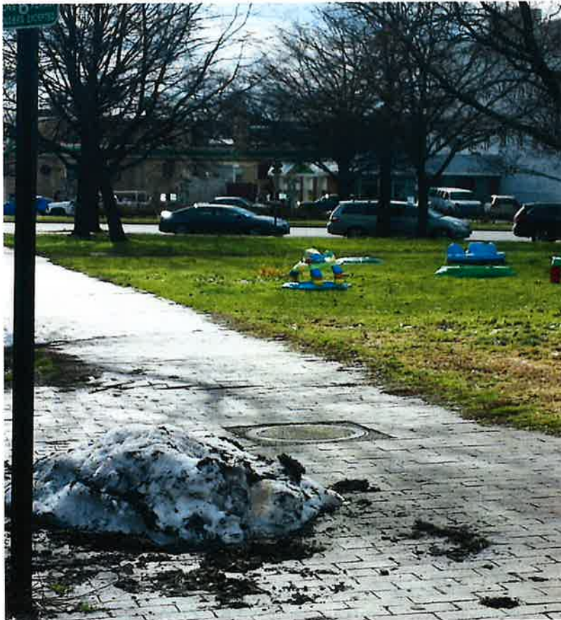
Photo 6b – North Plaza looking south at the east edge of the plaza. Note: the playground is shown in Photo 5b and the BP filling station in the background.