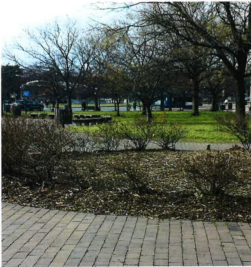
Photo 6a – North Plaza looking southwest with the Metro entrance in the background.