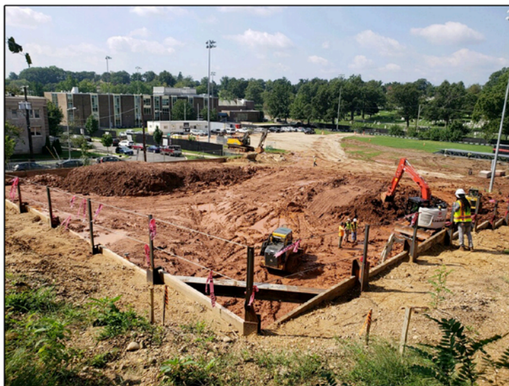
View from future recreation center towards 3rd and Evarts Streets