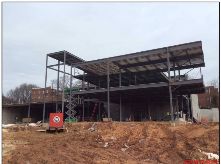
Progress view of new facility from the athletic field