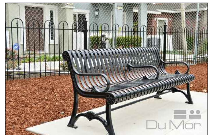
LINEAR BENCHES ALONG PATHS