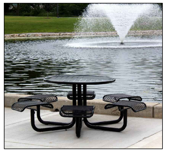
POWDER COATED ALUMINUM CAROUSEL TABLES