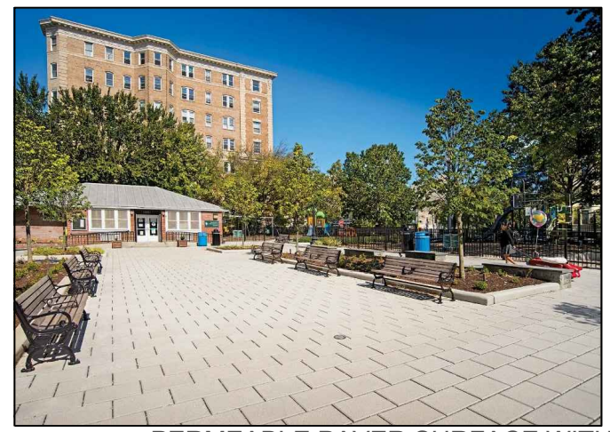
PERMEABLE PAVER SURFACE WITH STRUCTURAL SOIL IN TREE AREA