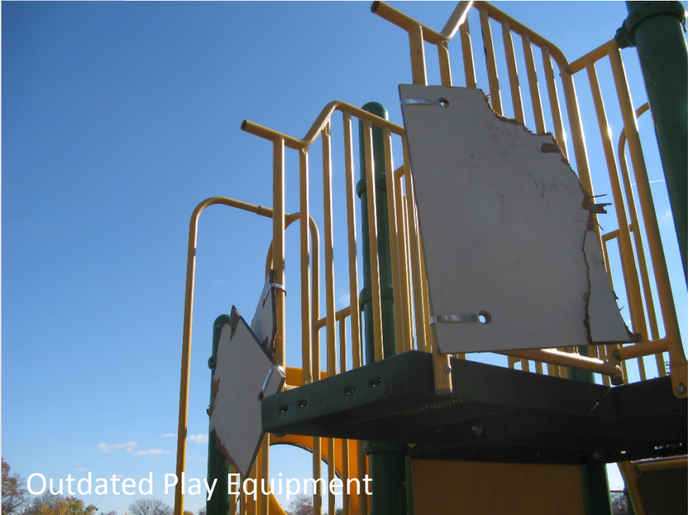
Outdated Play Equipment