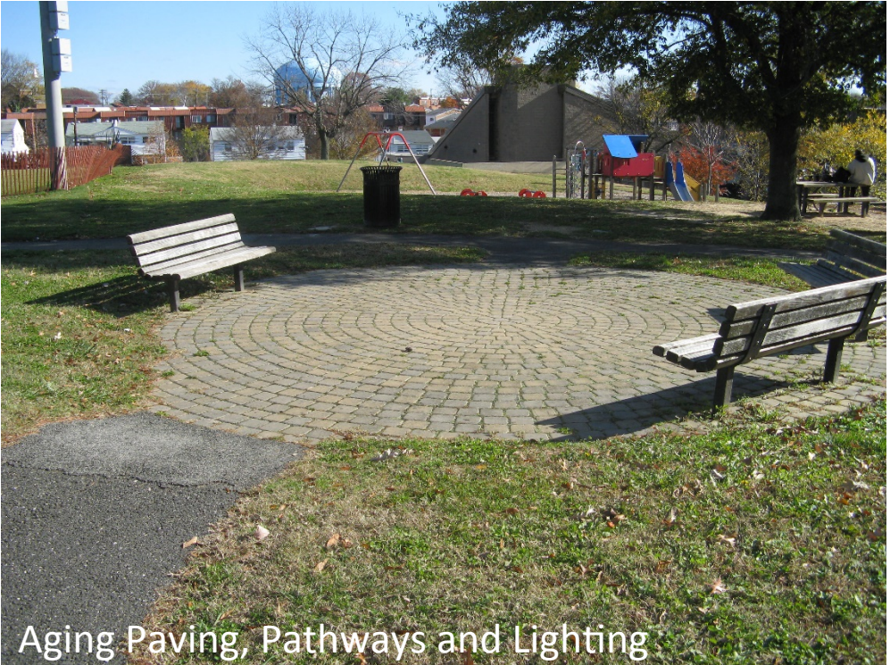
Aging Paving, Pathways and Lighting