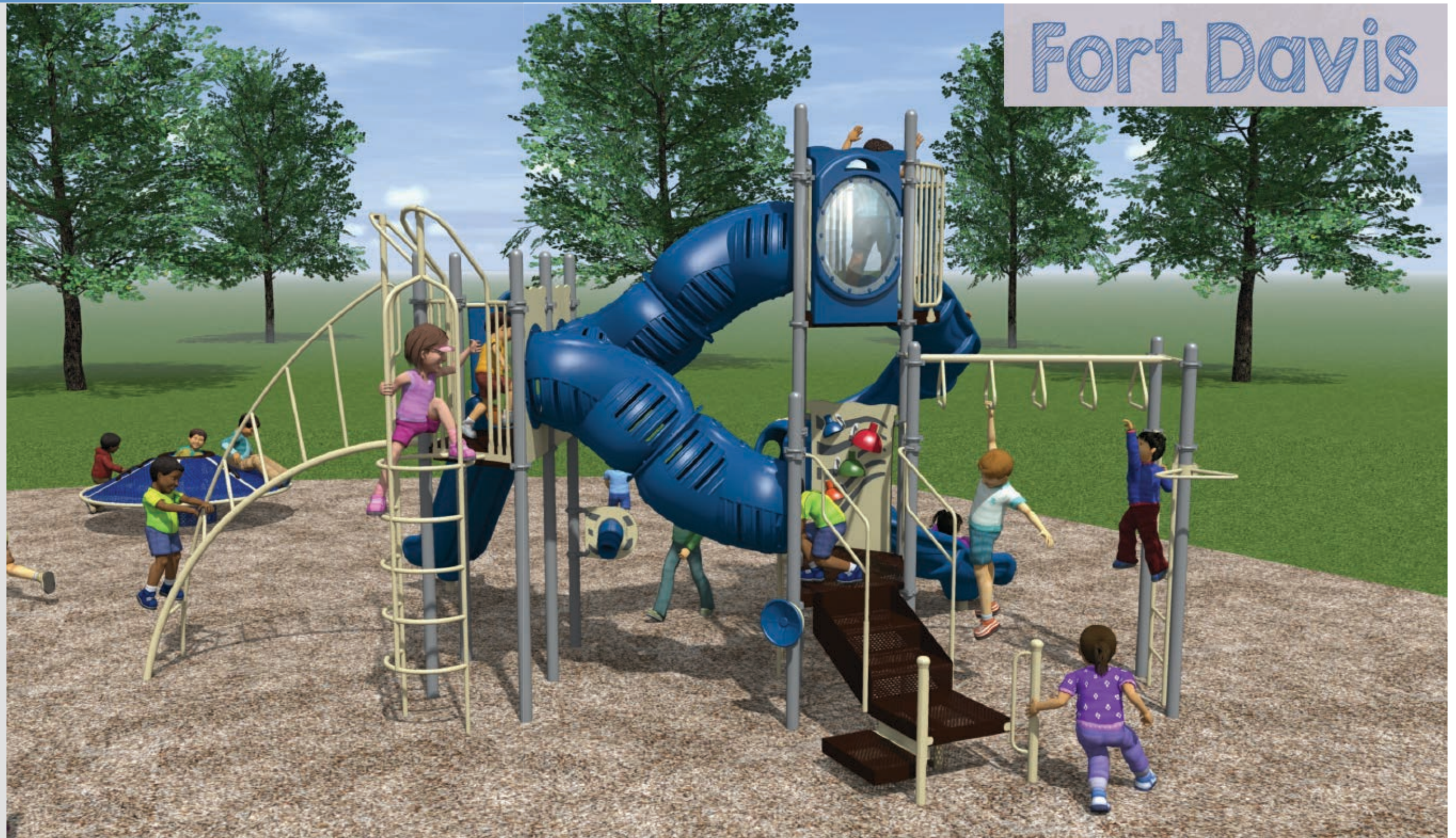
Fort Davis Playground & Splash Pad