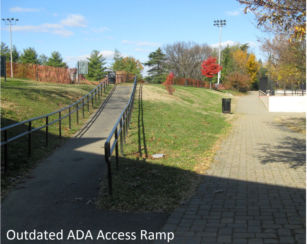
Outdated ADA Access Ramp