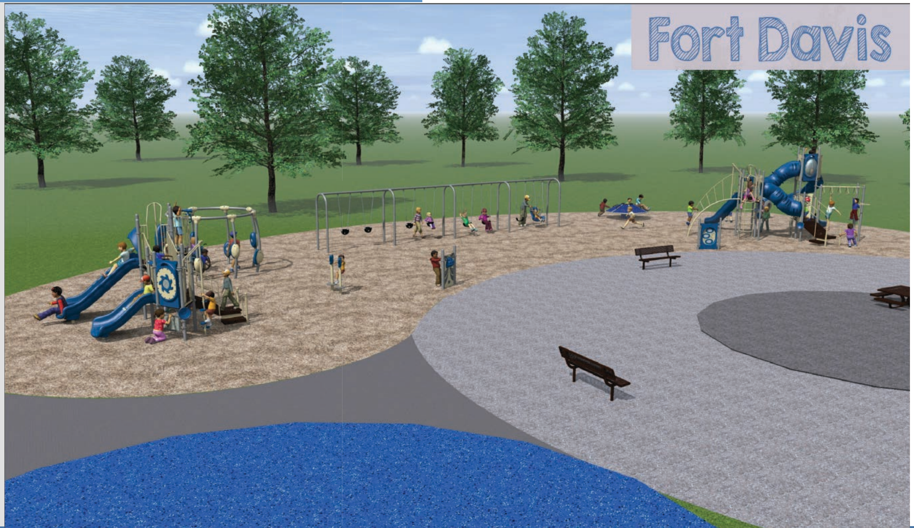
Fort Davis Playground & Splash Pad