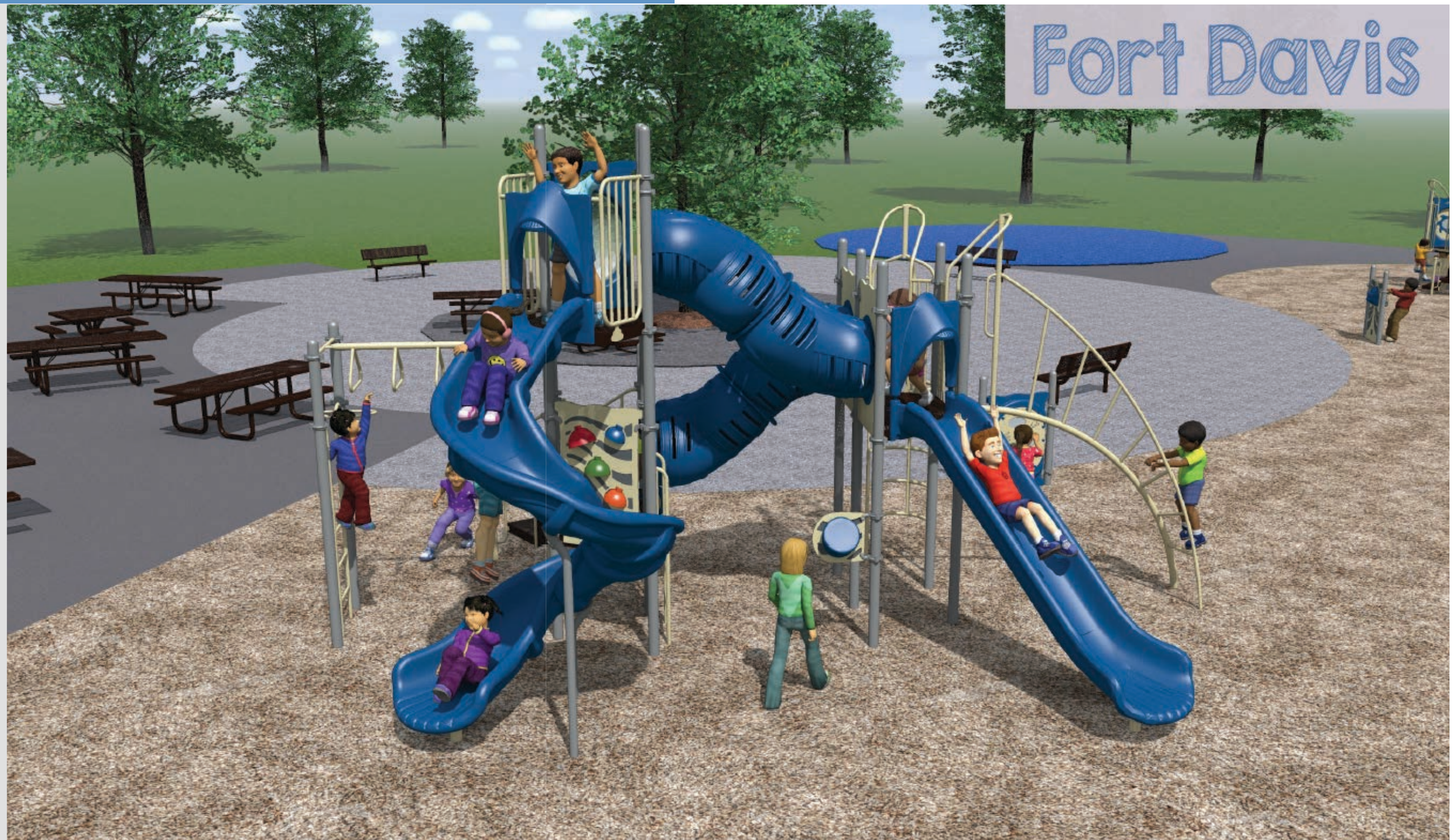
Fort Davis Playground & Splash Pad