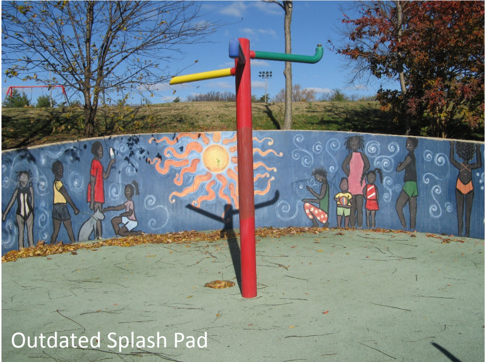
Outdated Splash Pad