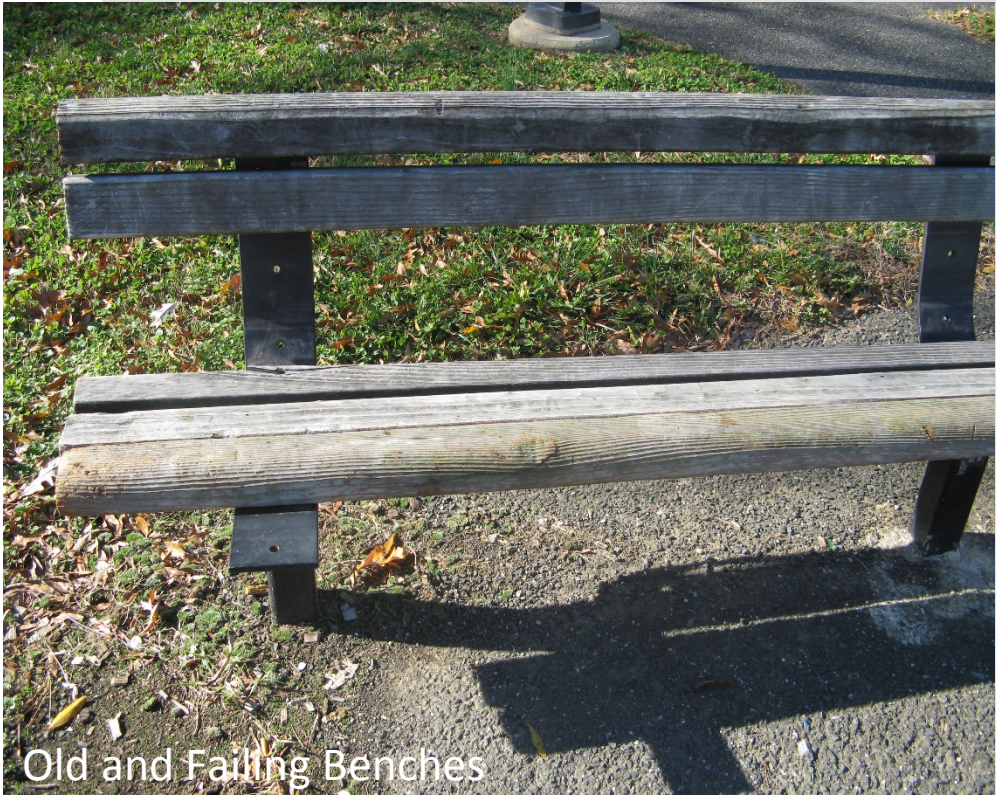
Old and Failing Benches