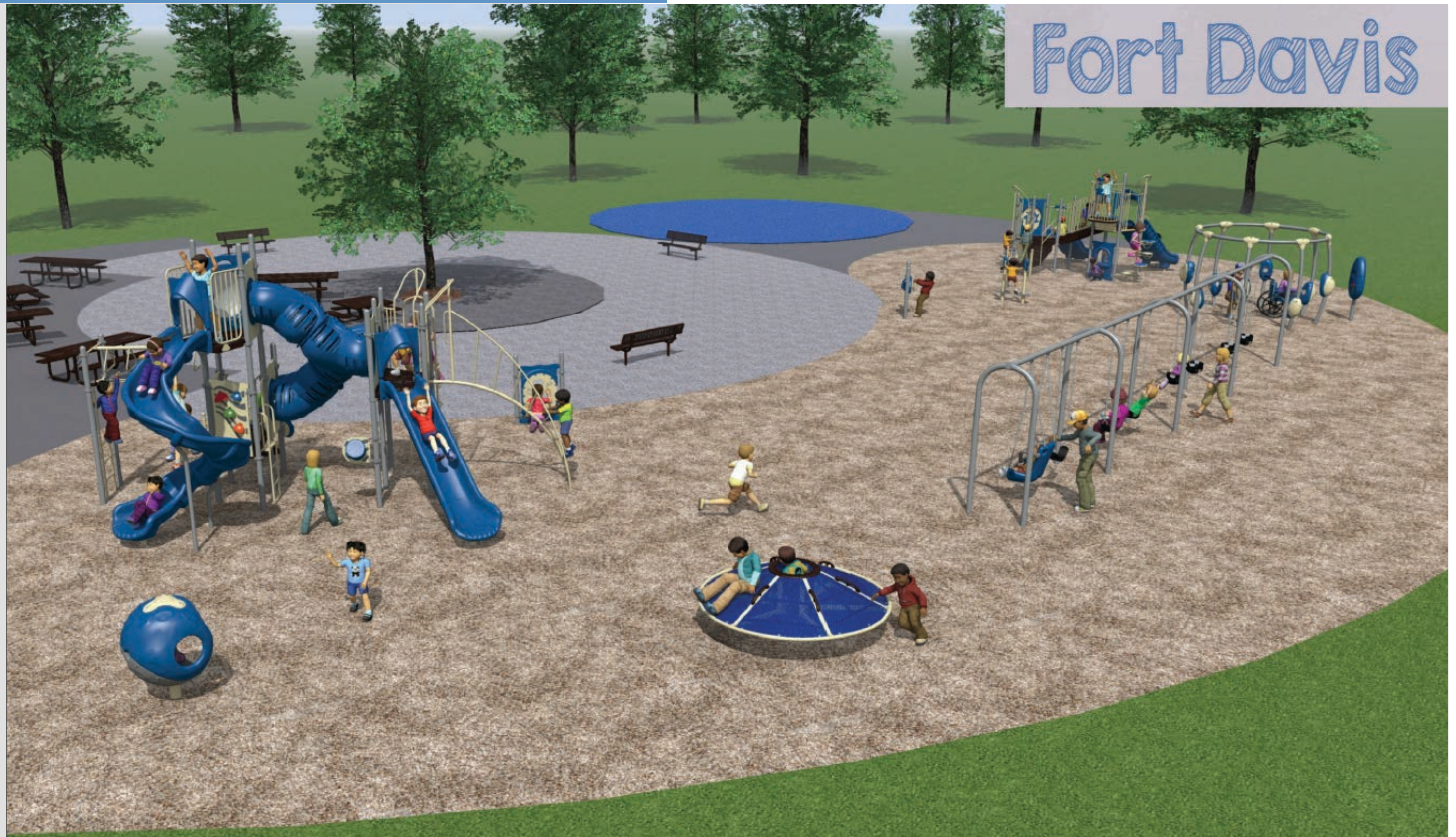
Fort Davis Playground & Splash Pad