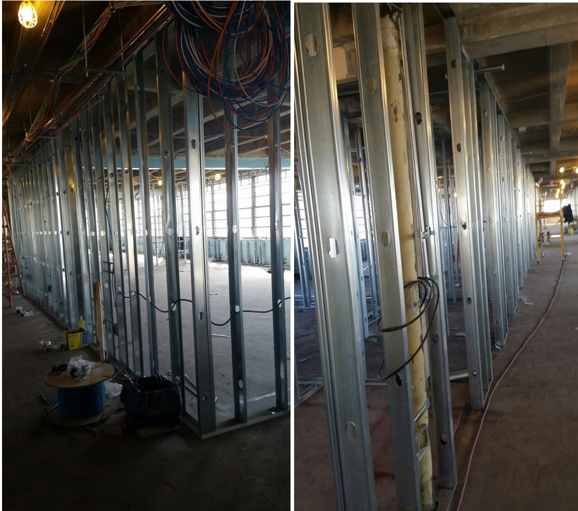
Framing at Second Floor

Please see below for recent photos from the project site.