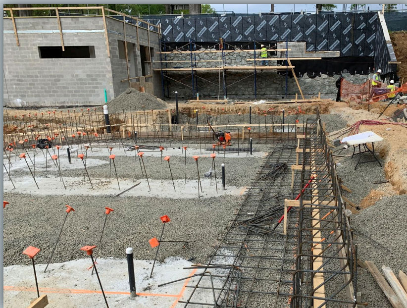
The stone veneer is being applied to the pool retaining walls