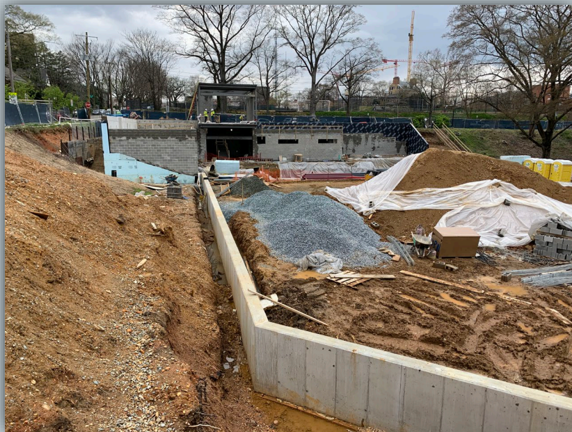
The new tennis court walls have now been installed