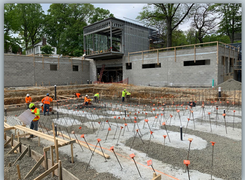
The steel in the pool slab was installed before the base plumbing

FOR ADDITIONAL INFORMATION: VISIT: dgs.dc.gov/node/1135096