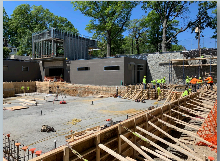
The base slab of the pool has now been poured