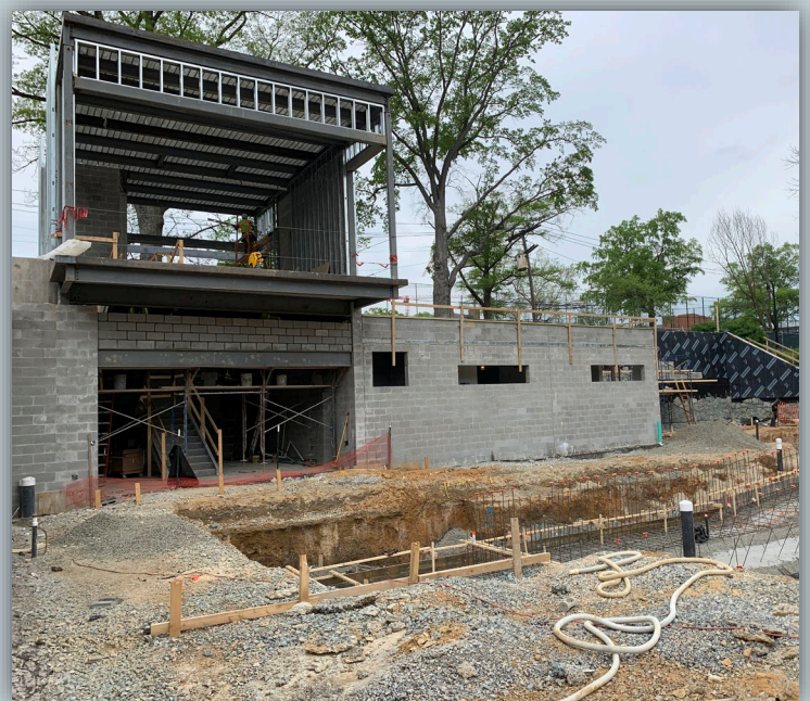
The upper floor of the pool house is being framed