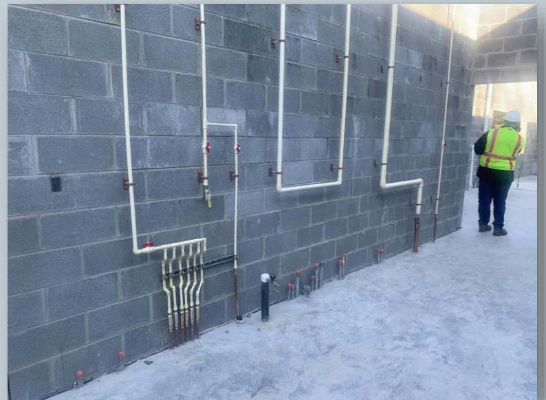
Pool house walls are built, concrete slab is poured, and rough-in plumbing and electrical are installed