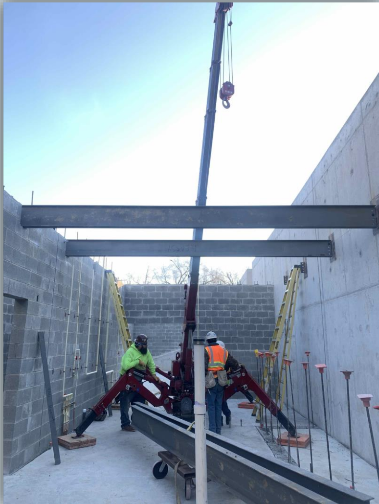
Steel being installed on the roof of the pool house using a movable crane