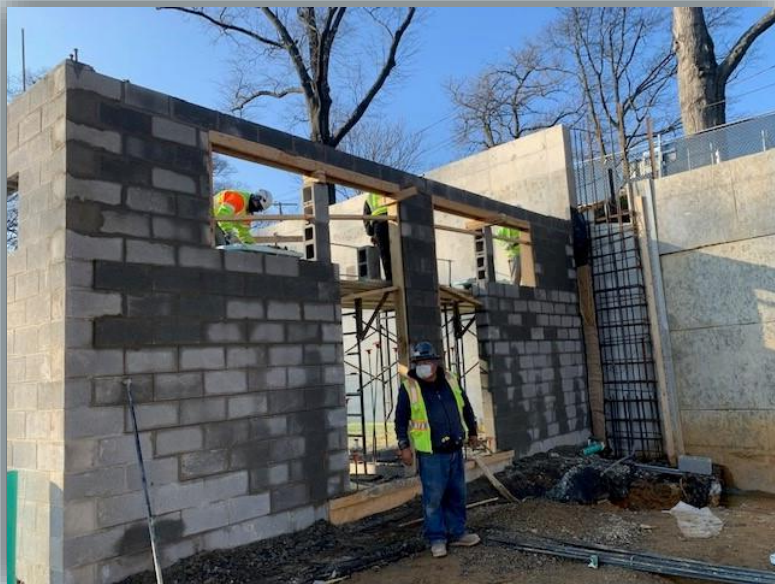
View of the exterior doorways for the locker rooms from the future pool deck