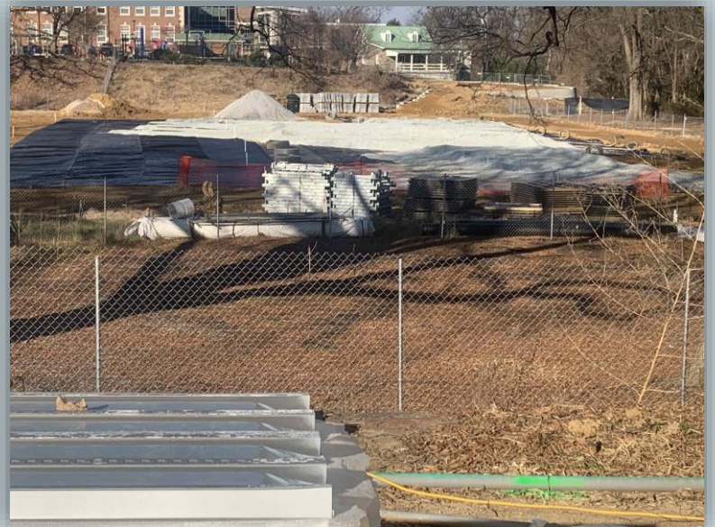
Drainage fabric and gravel being laid for the drainage system under the new grass soccer field

FOR ADDITIONAL INFORMATION: VISIT: dgs.dc.gov/node/1135096