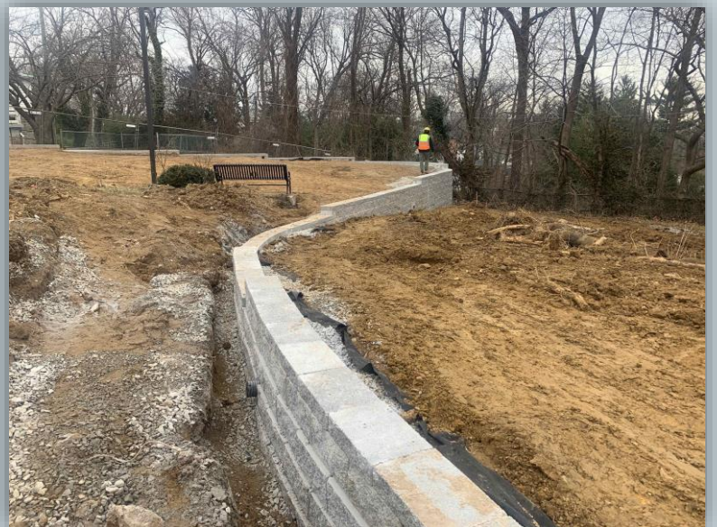
The retaining wall along the new ADA path from the school and recreation center is installed