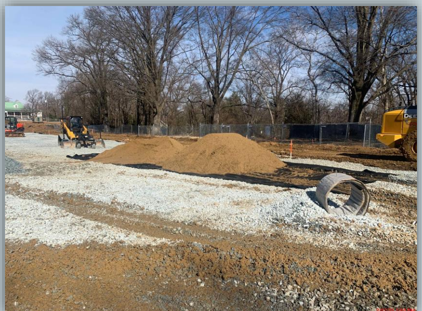
The topsoil for the field is being delivered and spread

FOR ADDITIONAL INFORMATION: VISIT: dgs.dc.gov/node/1135096