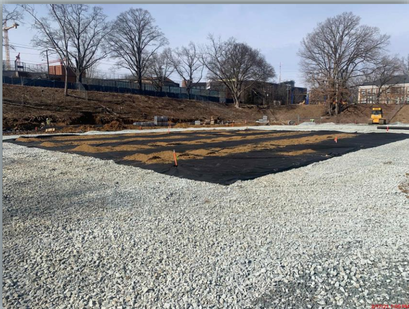
The filter fabric for the field drainage is being installed