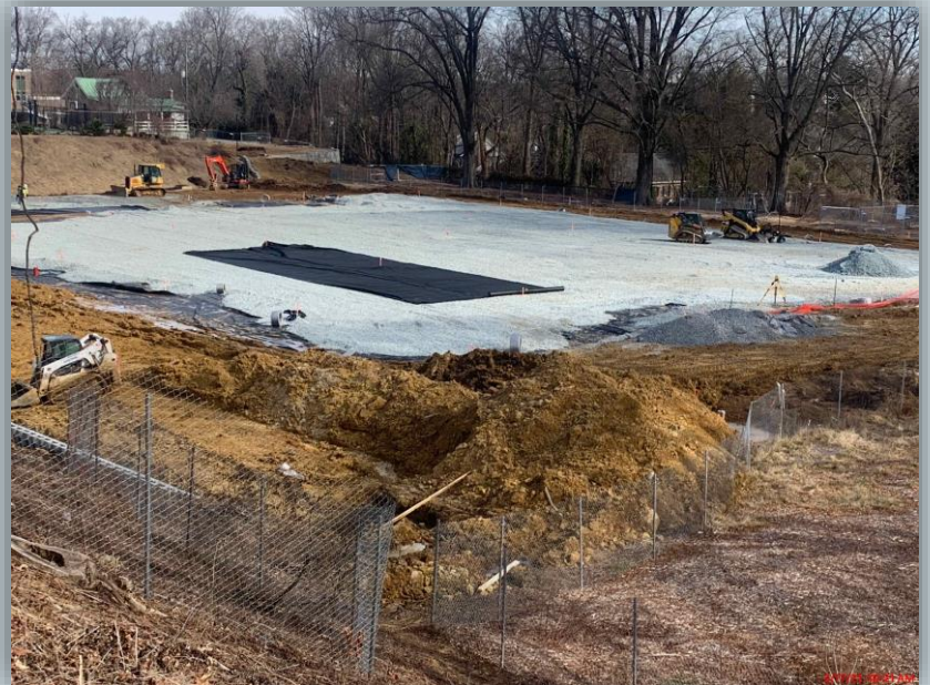
Most of the field underdrainage and gravel has been installed