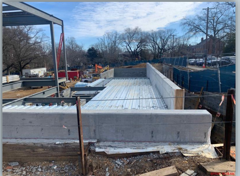
The Pool House roof deck has started