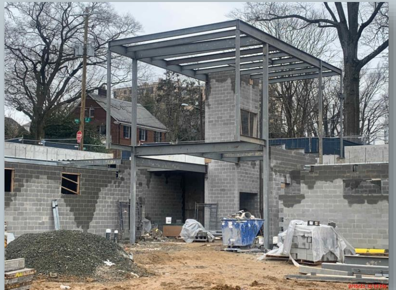
Pool house steel structure and elevator shaft are installed