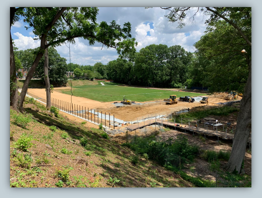
The field sod and grading are near complete with the boardwalk