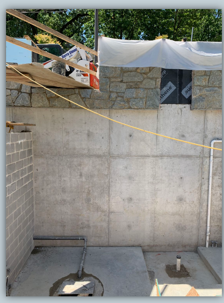
Storage area for the trash and recycling lift is being prepared