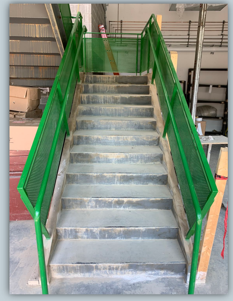
The interior staircase and railings are being installed