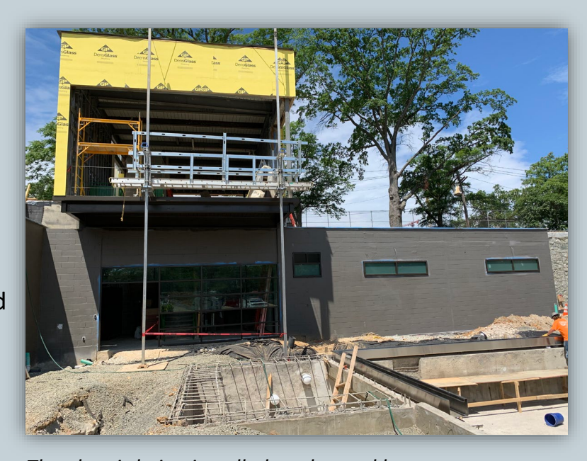
The glass is being installed on the pool house