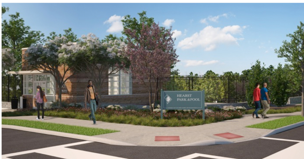
View facing north from corner of 37th Street and Quebec Street