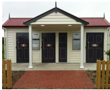
Samples of Automated Toilets