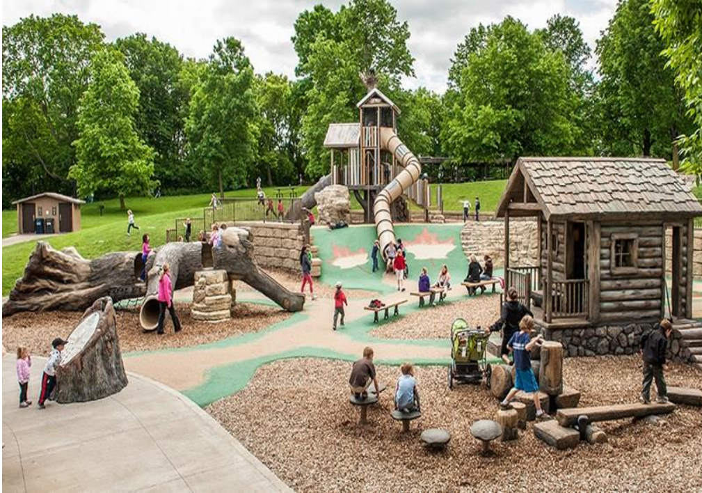
Nature Inspired Playground