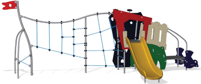
Colorful Play Equipment