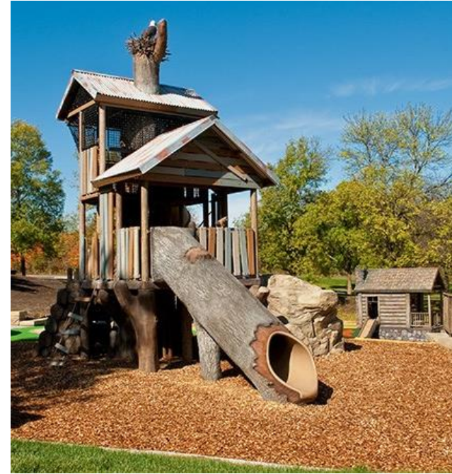
Nature Inspired Treehouse