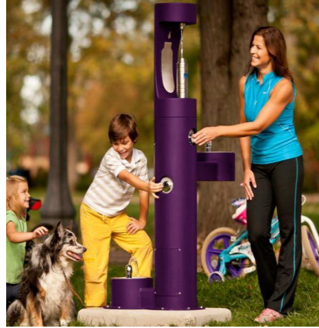
Sample Dog Fountain