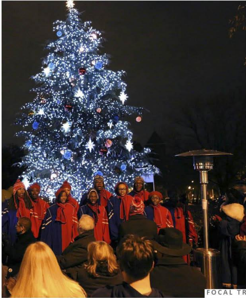
FOCAL TREE PLANTER