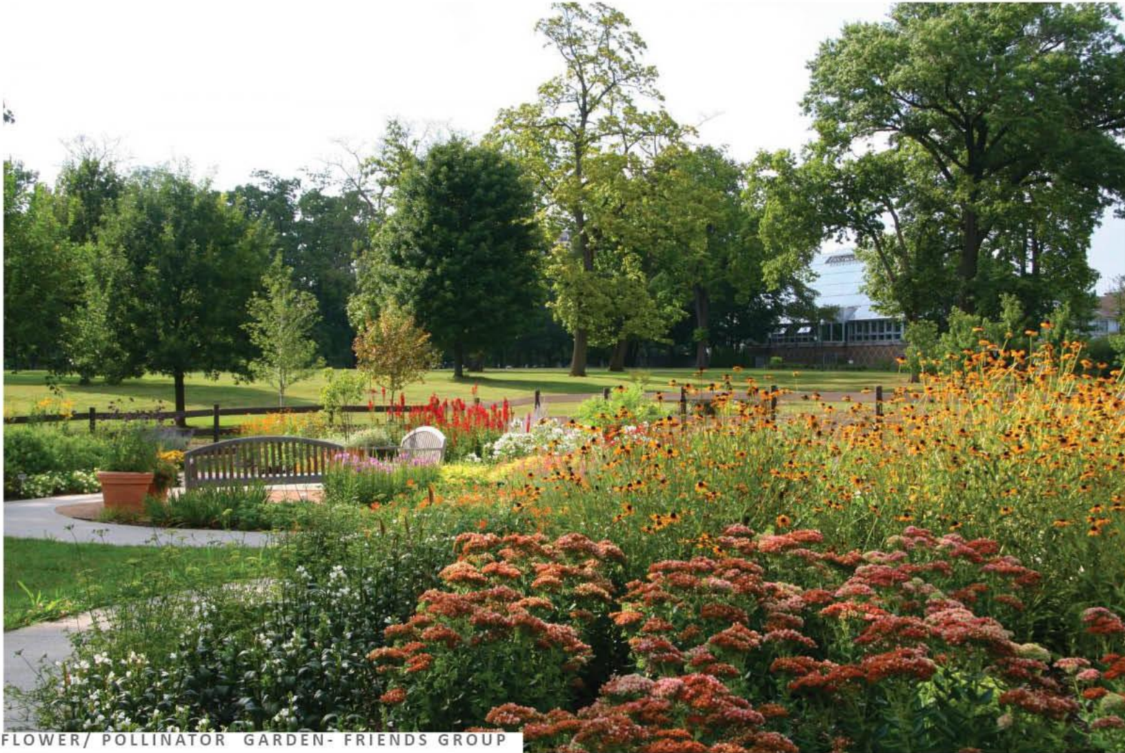
FLOWER/ POLLINATOR GARDEN- FRIENDS GROUP