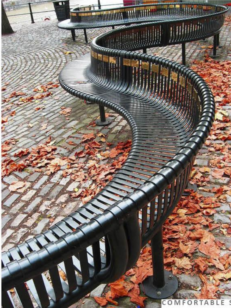
COMFORTABLE SEATING IN GARDEN