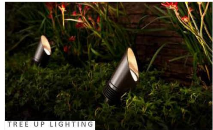
TREE UP LIGHTING