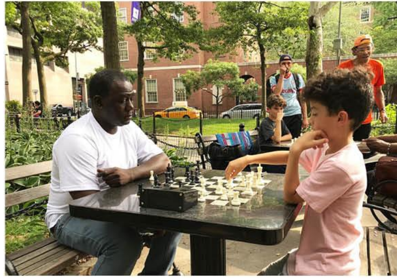
GAME/ CHESS TABLE