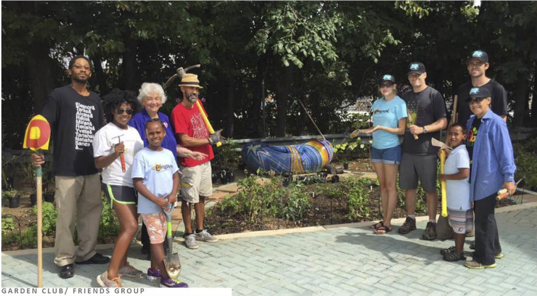
GARDEN CLUB/ FRIENDS GROUP