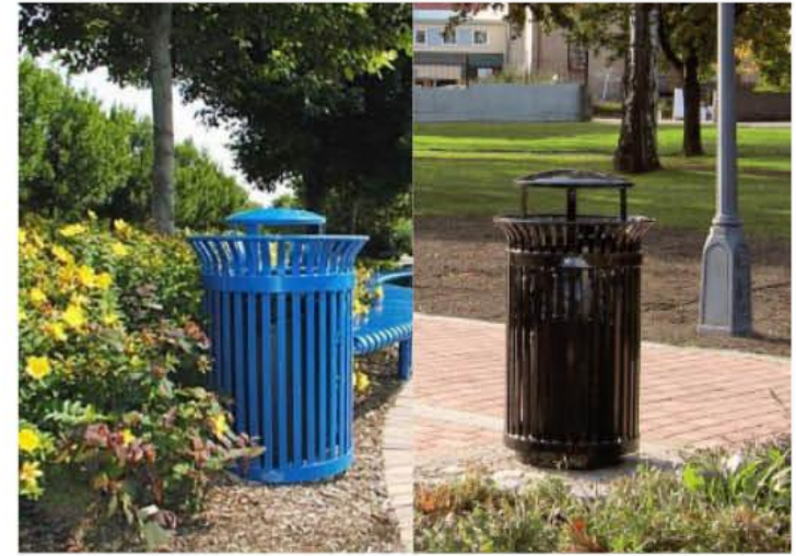
TRASH AND RECYCLING RECEPTACLE