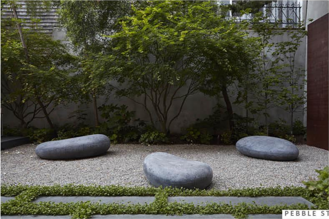
PEBBLE STONE SEAT