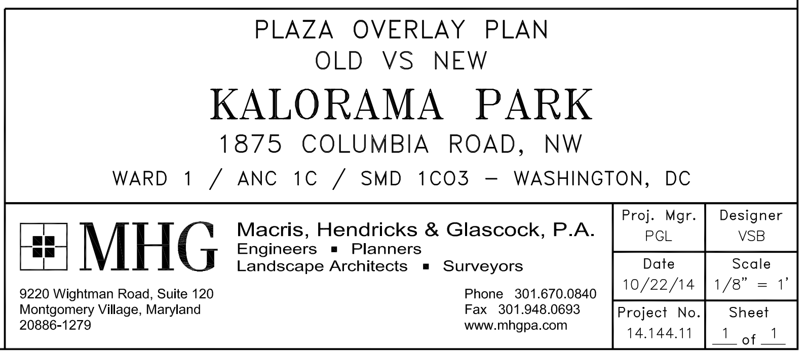
PLAZA OVERLAY PLAN