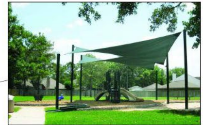
TRIANGULAR SHADE SAILS