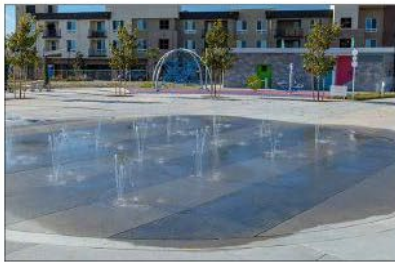
SPLASH PAD EXAMPLE