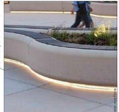
BENCHES WITH RECESSED LIGHTING