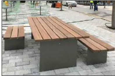
TABLE AND CHAIRS EXAMPLE