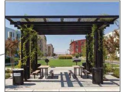
CLIMBING PLANTS AT EXISTING PAVILION POSTS