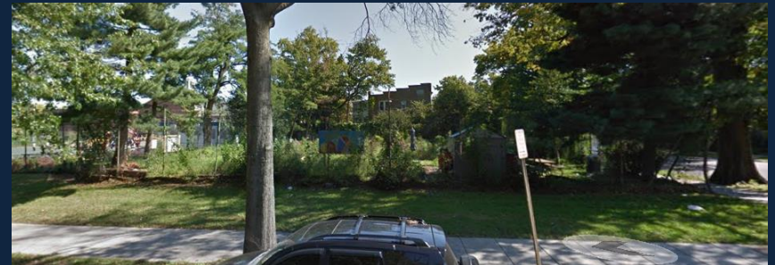
Twin Oaks Gardens - SOUTH