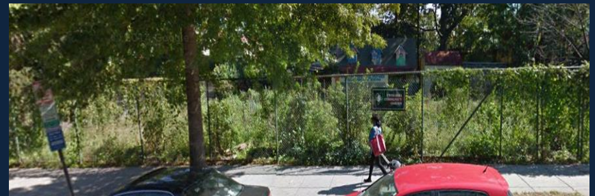
Twin Oaks Gardens - NORTH