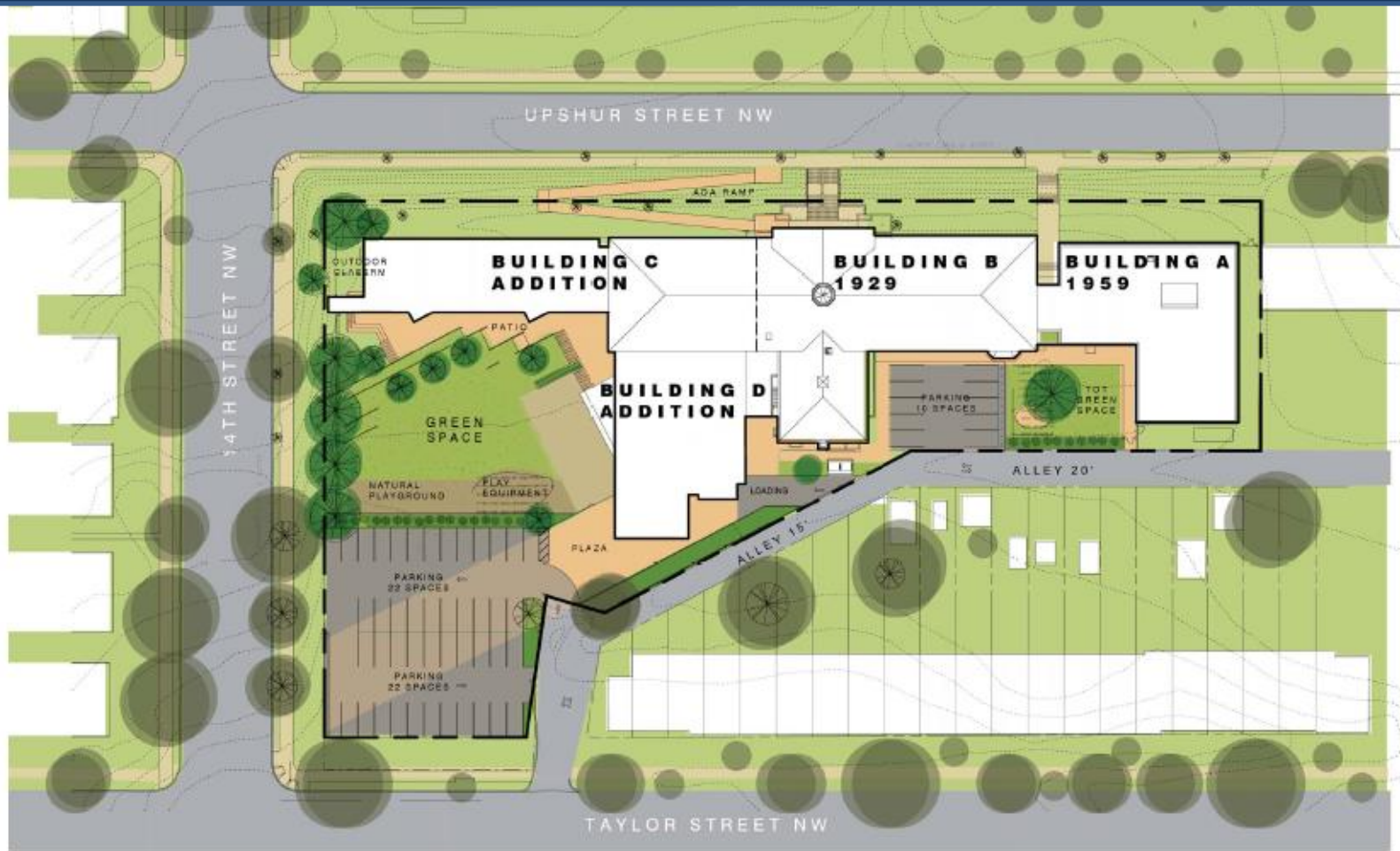
Site Plan - Proposed Master Plan