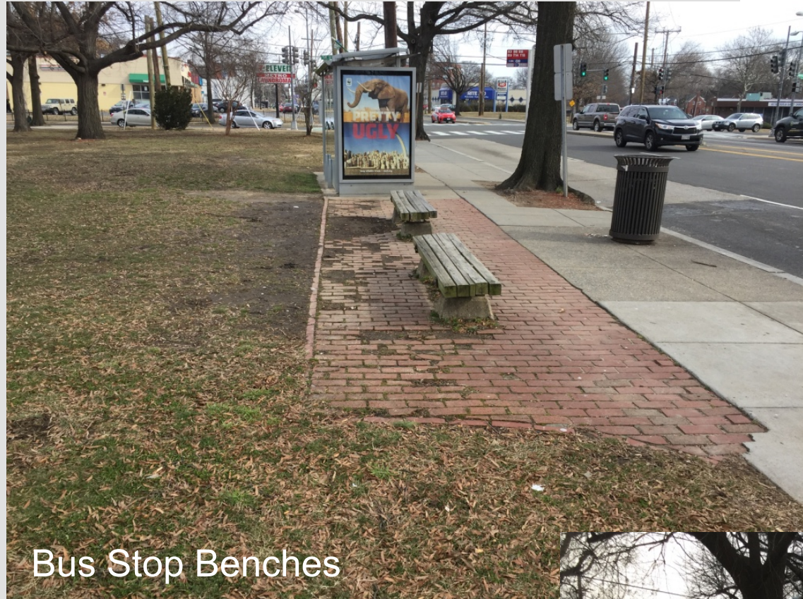
Bus Stop Benches