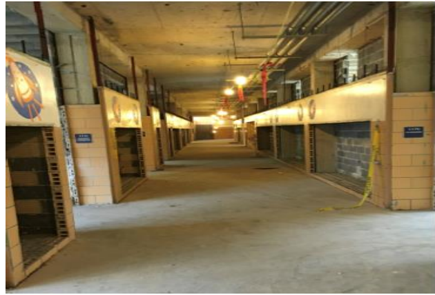
First Floor Typical Academic Wing