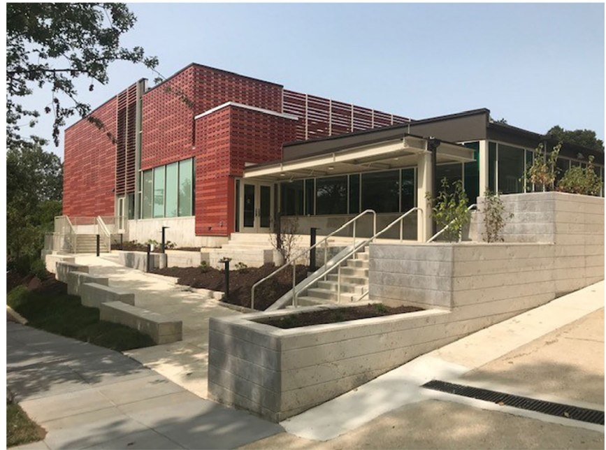
View of new facility from Jonquil Street.

According to WJLA, the rain event that occurred on September 10th broke a daily rainfall record in D.C. that stood for 70 years, with an official total of 2.88", with some District locations getting up to 4". While the flash flood left cars stranded and flooded several homes and facilities - it also served as a good test for the new facility, with the bioretention and waterproofing performing exceptionally well. Only recently installed sod was displaced.