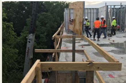
5 th fl. Structural Panel Install