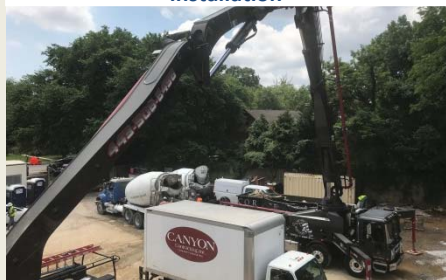
Concrete Delivery & installation