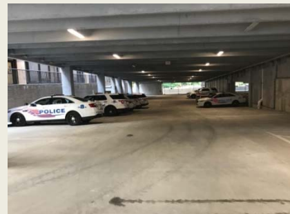
July 1, Ground Level

For your safety, only authorized personnel are allowed to access the construction sites