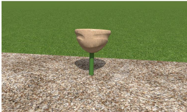
3 Spinner Bowl