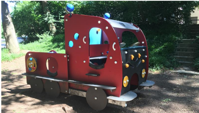
5 Ex. Fire Truck