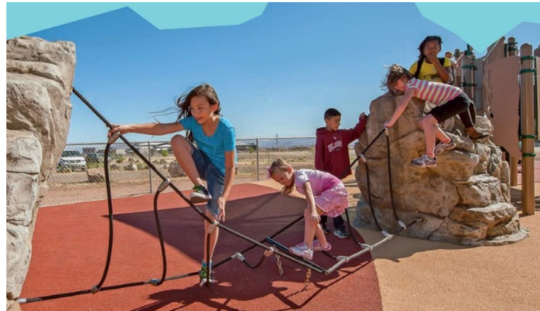
4 Boulder and Ropes