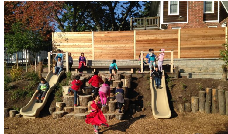
6 Hillside Embankment Slides